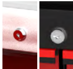
Two locks lockable