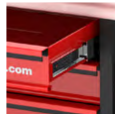
Stable ball bearing