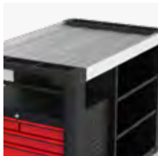
Stainless steel surface