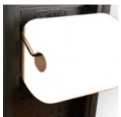
Paper roll holder included