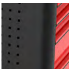
Integrated corner protection