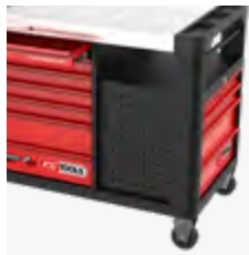
Twelve drawers each load capacity up to 50 kg