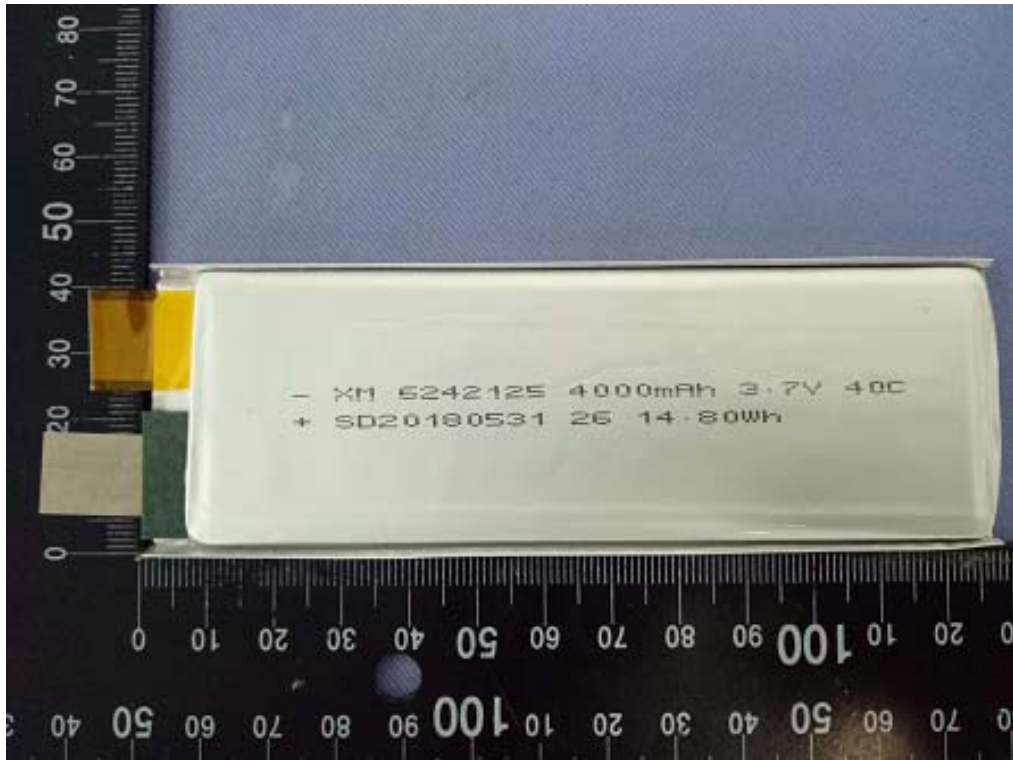
Figure 3 Top view of cell