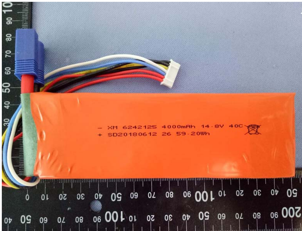
Figure 1 Top view of Battery