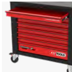
8 Drawers each load capacity up to 50 kg