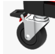
Anti-static castors with brakes