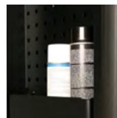
Can holder included