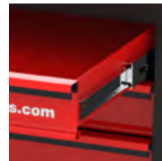
Stable ball bearing