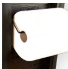
Paper roll holder included