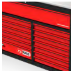
Fourteen drawers each load capacity up to 65 kg