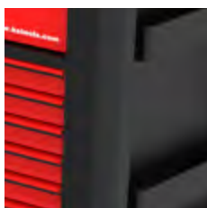
Integrated corner protection