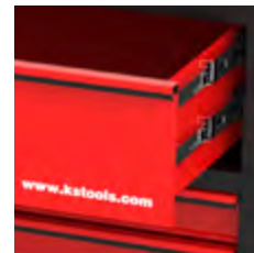
Stable ball bearing