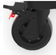
Anti-static castors with brakes