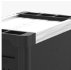
Stainless steel surface