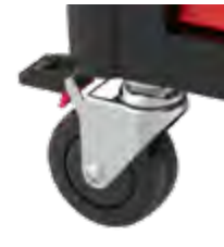
Anti-static castors with brakes