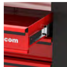
Stable ball bearing