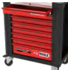
Eight drawers each load capacity up to 50 kg