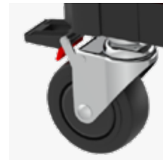
Anti-static castors with brakes