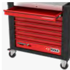
8 Drawers each load capacity up to 50 kg