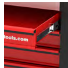
Stable ball bearing