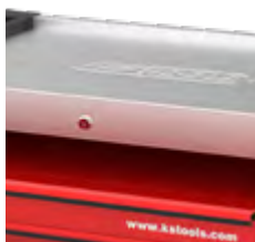
Stainless steel surface